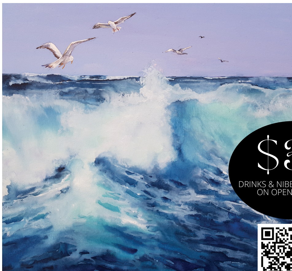
Eddy, Pamela, (2022). Flying Over The Break [Acrylic].