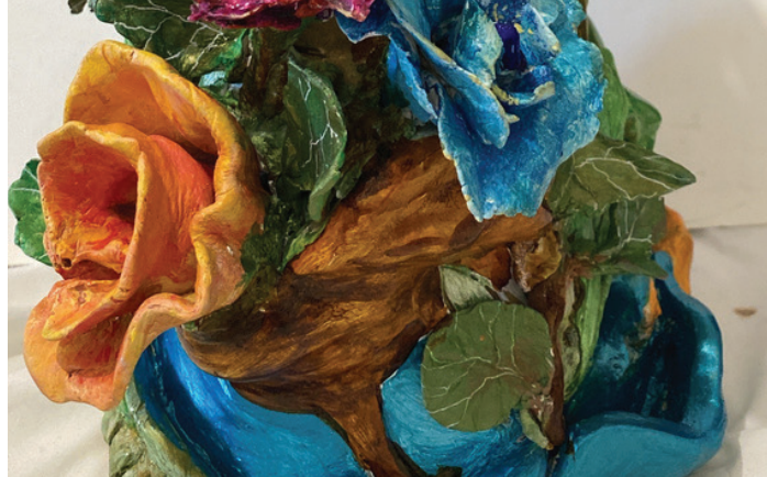
Maliepaard, Michelle, (2022). Flower vase [Mixed media].